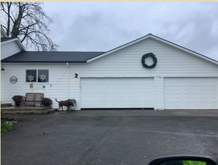
Addition AGU 01.04.24 L2

No improvement data available for all other stat class types.