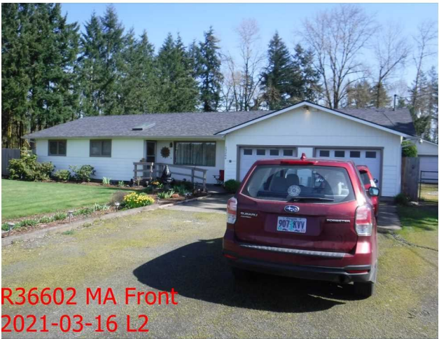
R36602 MA Front 2021-03-16 L2