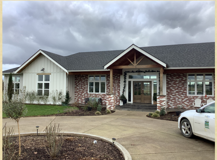
MA 01.23.24 L2