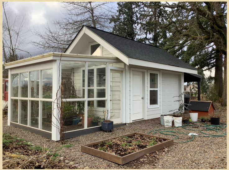
MP 01.23.24 L2