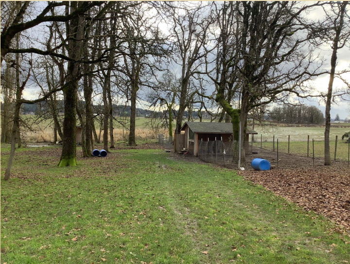
MP 01.23.24 L2