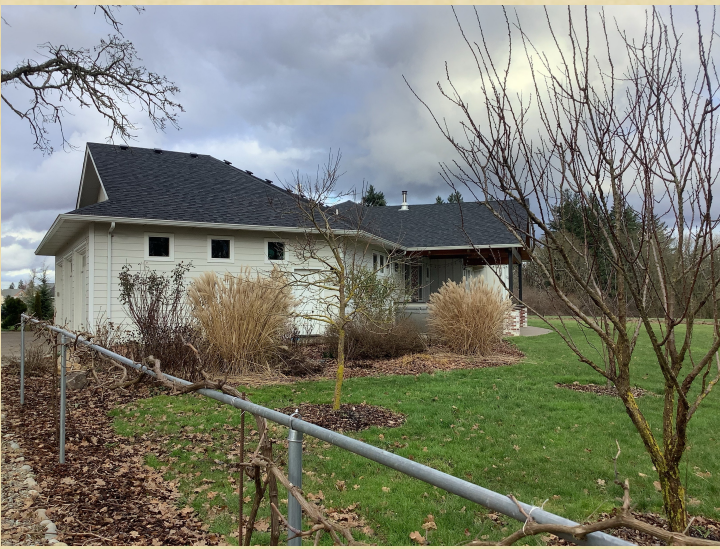
BACK AGF MA 01.23.24 L2