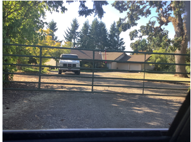
MA AGF 09.22.23 L3