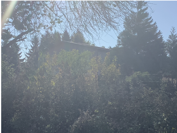
GB SOLAR 09.22.23 L3