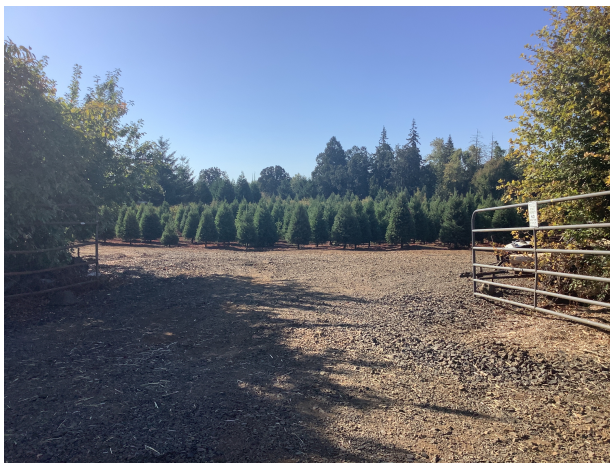
FARM XMAS TREES 09.22.23 L3