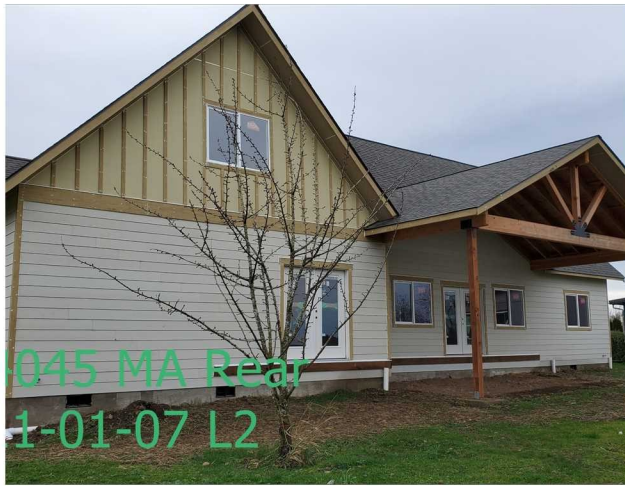
045 MA Rear 1-01-07 L2