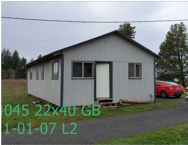
045 22x40 GB 1-01-07 L2