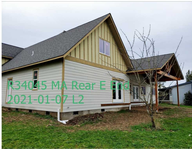
R34045 MA Rear E End 2021-01-07 L2