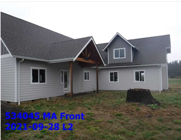
534045 MA Front 2021-09-28 L2