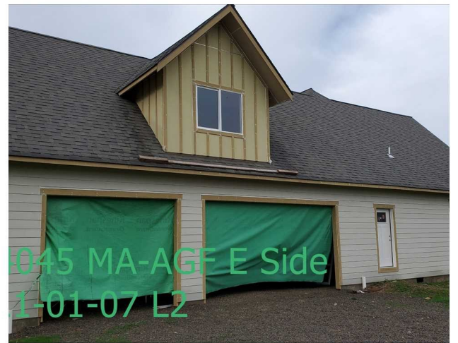
045 MA-AGF E Side 1-01-07 L2