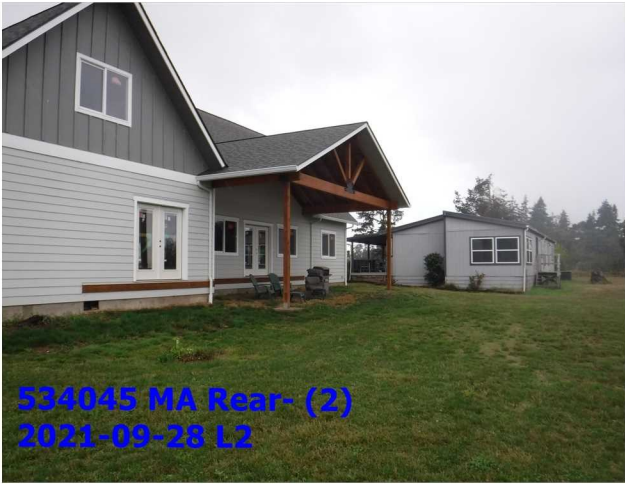
534045 MA Rear- (2) 2021-09-28 L2