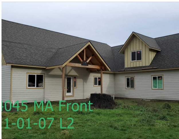
045 MA Front 1-01-07 L2