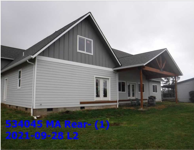
534045 MA Rear- (1) 2021-09-28 L2