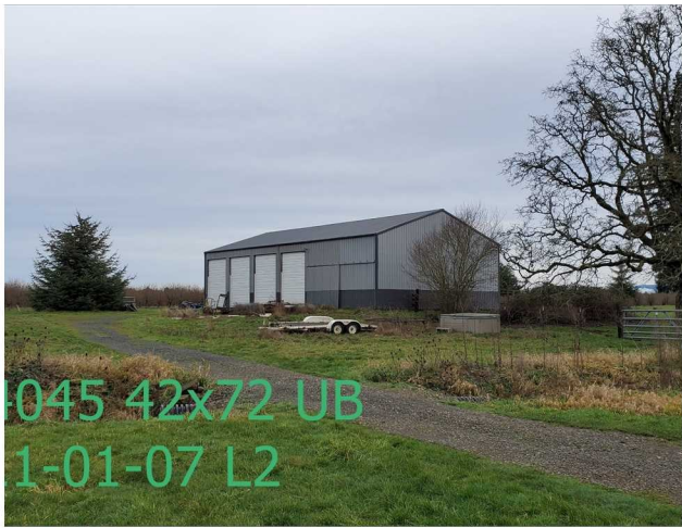
045 42x72 UB 1-01-07 L2