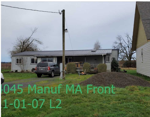
045 Manuf MA Front 1-01-07 L2