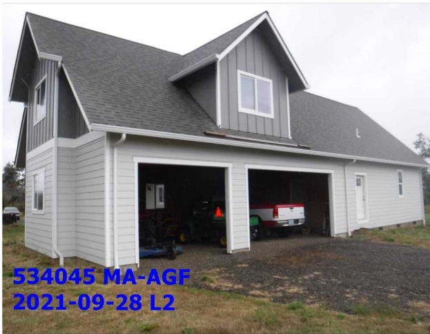
534045 MA-AGF 2021-09-28 L2