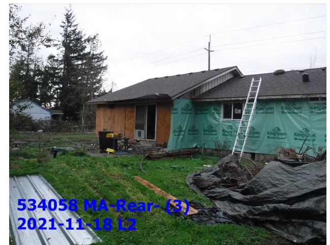
534058 MA-Rear- (3) 2021-11-18 L2