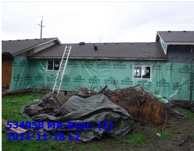
534058 MA-Rear- (2) 2021-11-18 L2