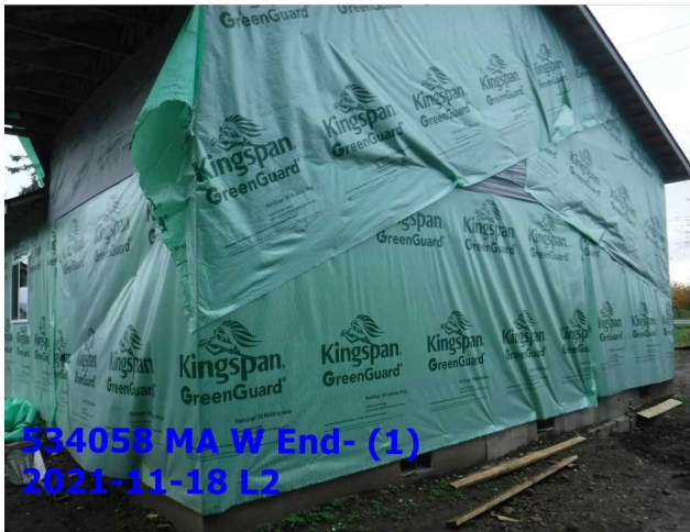
534058 MA W End- (1) 2021-11-18 L2