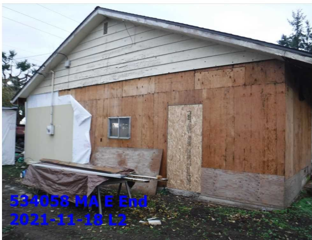
534058 MA E End 2021-11-18 L2