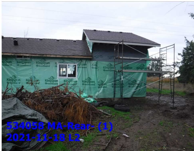
534058 MA-Rear- (1) 2021-11-18 L2