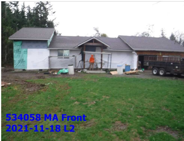
534058 MA Front 2021-11-18 L2