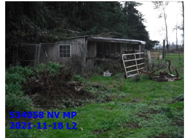
534058 NV MP 2021-11-18 L2