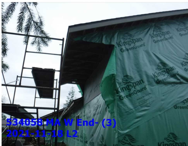
534058 MA W End- (3) 2021-11-18 L2