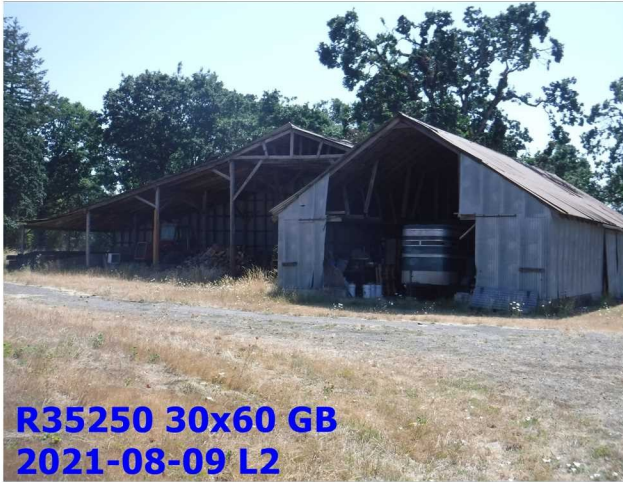
R35250 30x60 GB 2021-08-09 L2