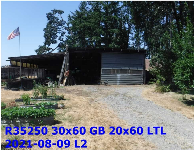
R35250 30x60 GB 20x60 LTL 2021-08-09 L2