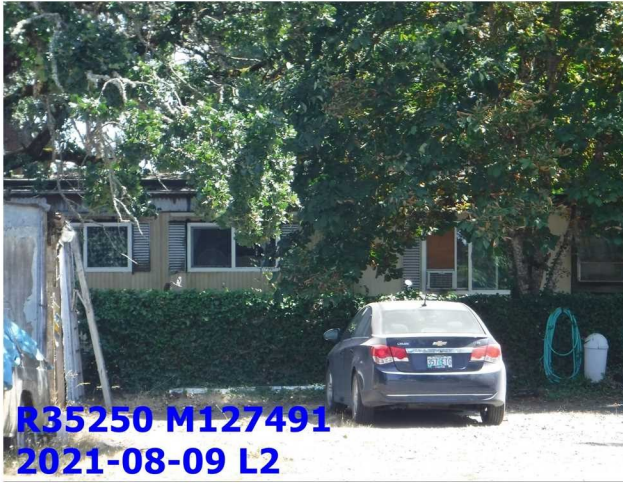
R35250 M127491 2021-08-09 L2