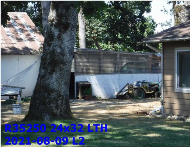
R35250 24x32 LTH 2021-08-09 L2