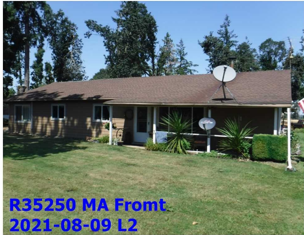
R35250 MA Fromt 2021-08-09 L2