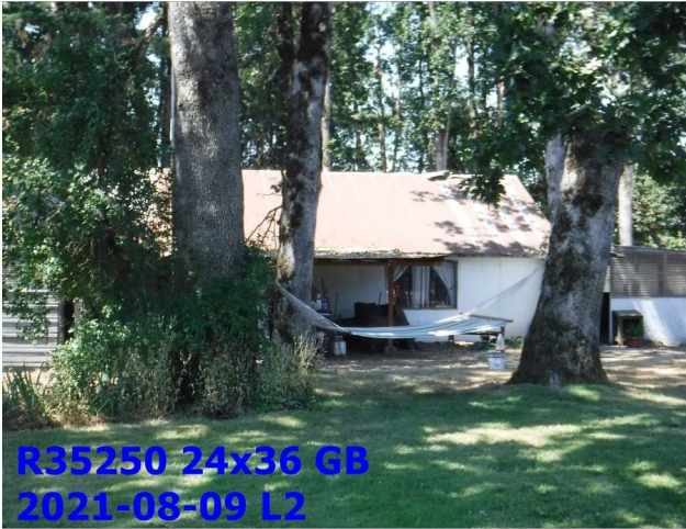
R35250 24x36 GB 2021-08-09 L2