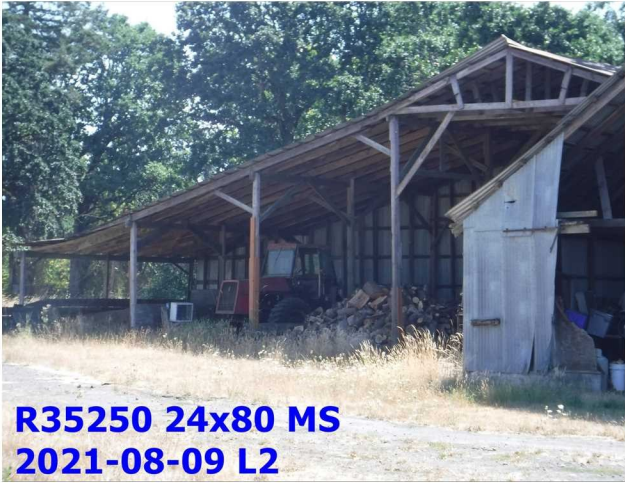
R35250 24x80 MS 2021-08-09 L2