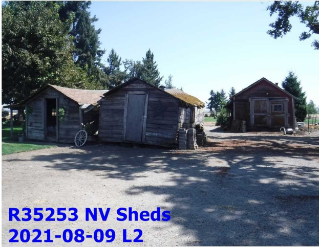
R35253 NV Sheds 2021-08-09 L2