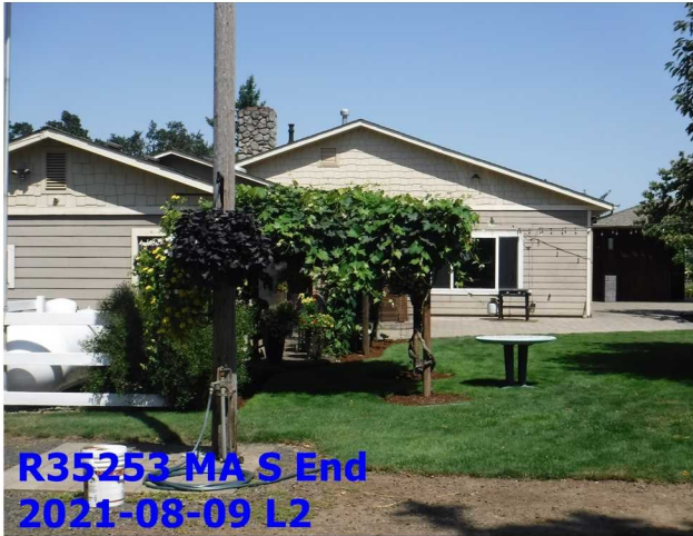
R35253 MA S End 2021-08-09 L2