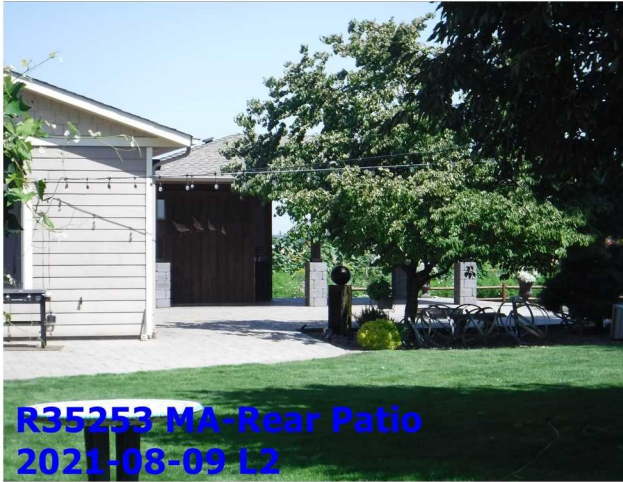
R35253 MA-Rear Patio 2021-08-09 L2