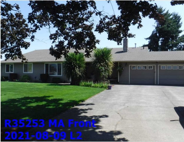
R35253 MA Front 2021-08-09 L2