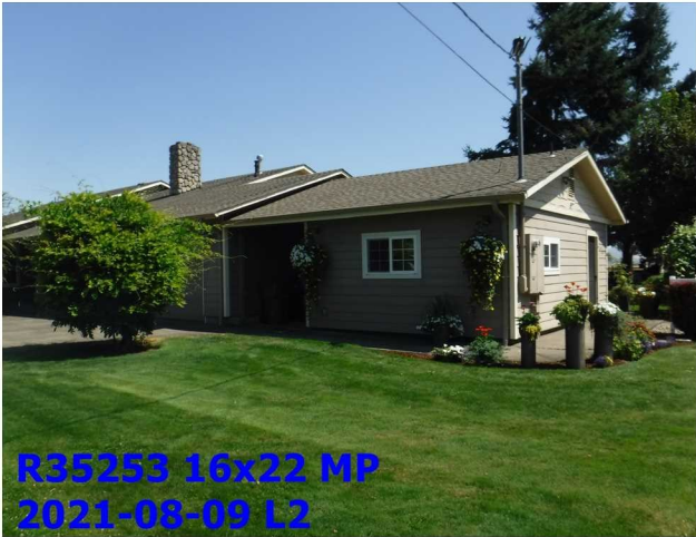
R35253 16x22 MP 2021-08-09 L2