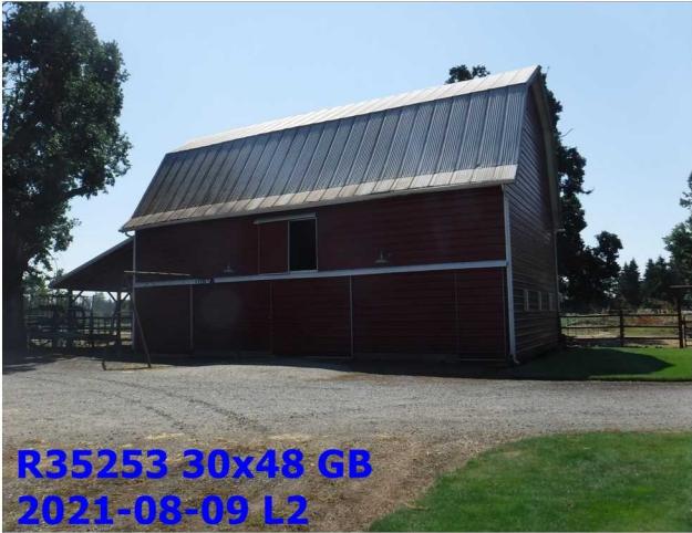
R35253 30x48 GB 2021-08-09 L2