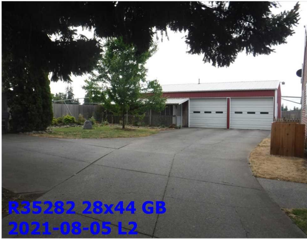
R35282 28x44 GB 2021-08-05 L2