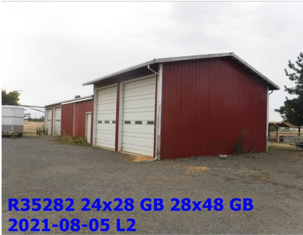
R35282 24x28 GB 28x48 GB 2021-08-05 L2