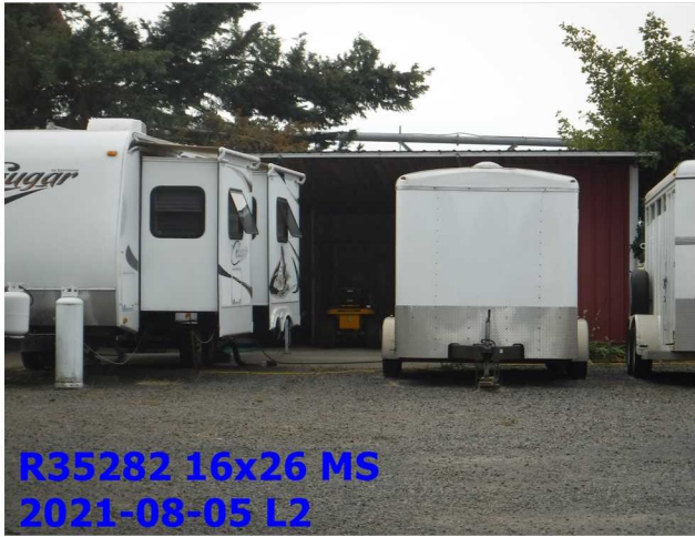
R35282 16x26 MS 2021-08-05 L2