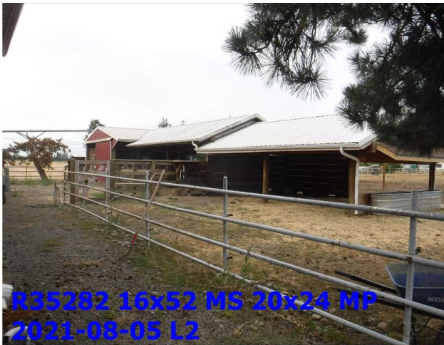
R35282 16x52 MS 20x24 MP 2021-08-05 L2