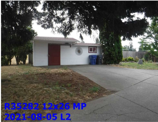
R35282 12x26 MP 2021-08-05 L2