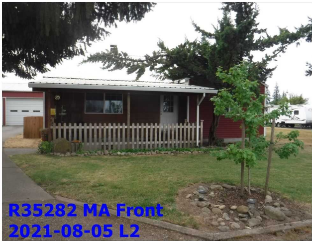
R35282 MA Front 2021-08-05 L2