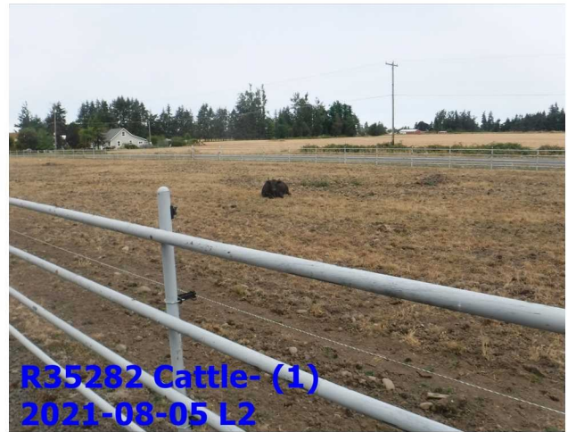
R35282 Cattle- (1) 2021-08-05 L2