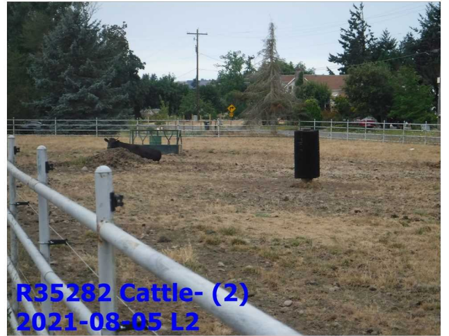
R35282 Cattle- (2) 2021-08-05 L2