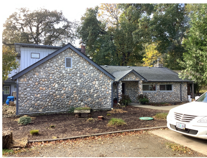
357 FC 4 20X98 2015 EXEMPT