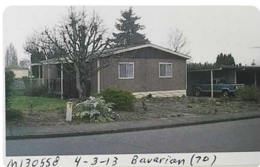
M130558 4-3-13 Bavarian (70)

per owner natural stone-ct Cabs new floor Replace shower new floors painted