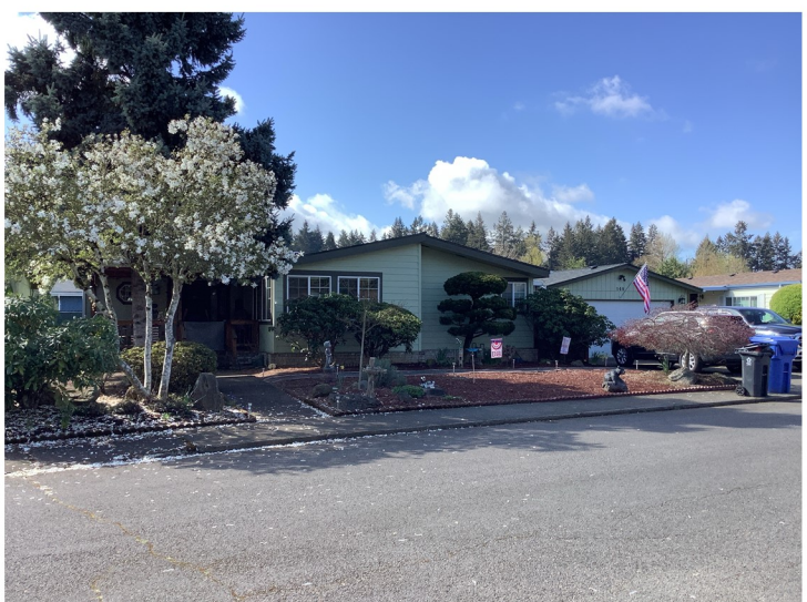
Photo with new Bathrooms m/s new flex plumbing floors, roof, & fan

No improvement data available for all other stat class types.