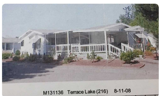
M131136 Terrace Lake (216) 8-11-08

Handwritten notes: Pickies very clean wall over Lots of cabinet - kit Blt in in Landry luxury vinyl granite ct in Bath