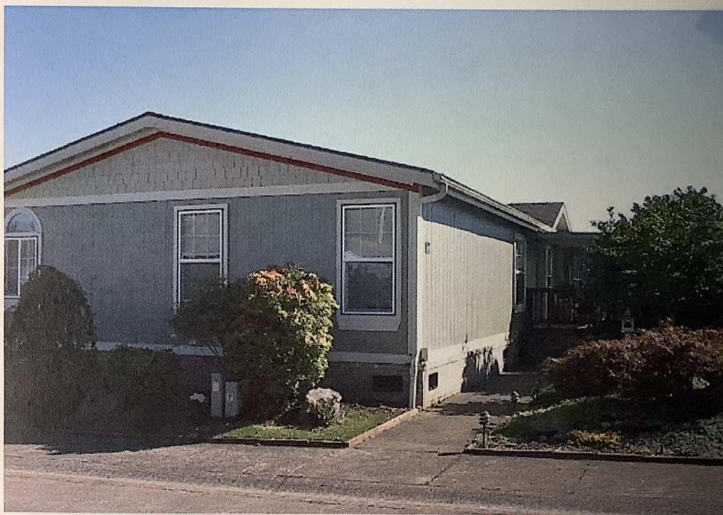
M131872 Terrace Lake (17) 9-9-15