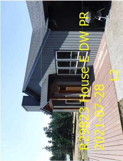
R29823 House E DW PR 2021-07-28 L2