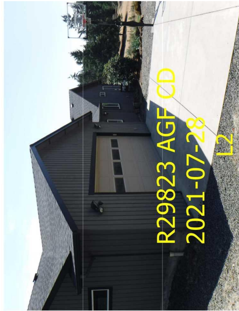
R29823 AGF CD 2021-07-28 L2