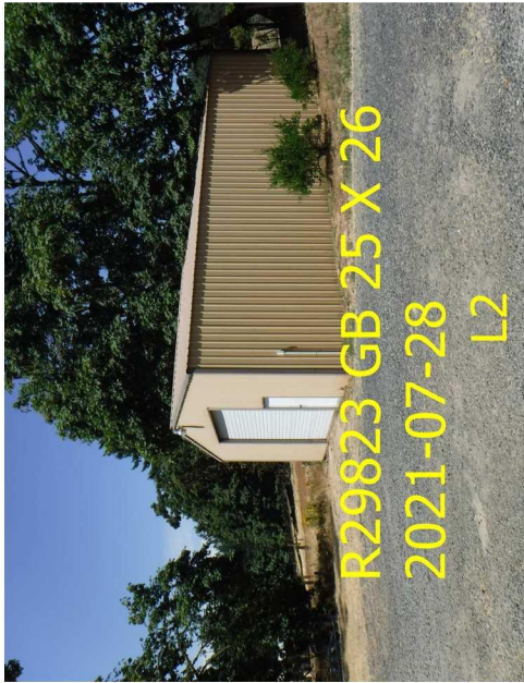
R29823 GB 25 X 26 2021-07-28 L2