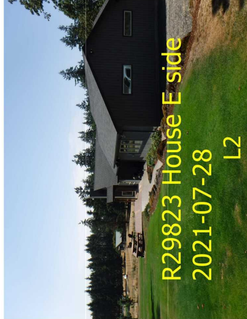
R29823 House E side 2021-07-28 L2