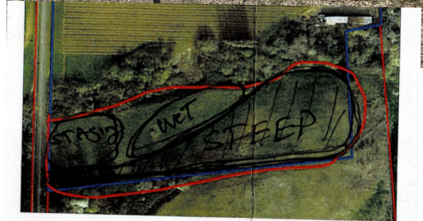
PHOTO ON RIGHT PER EMAIL FROM GREG FRIES ST JORY VINEYARD 9/26/24 IN RESPONSE TO LETTER.