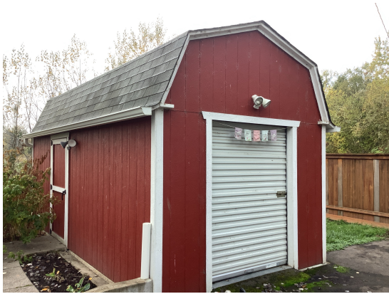
MP 16x26 ↑