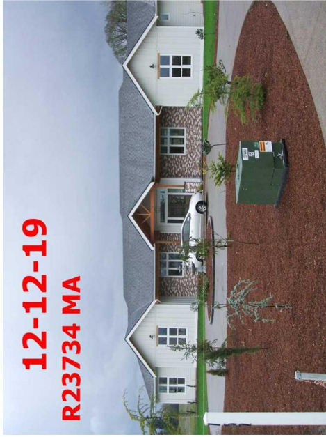
12-12-19 R23734 MA