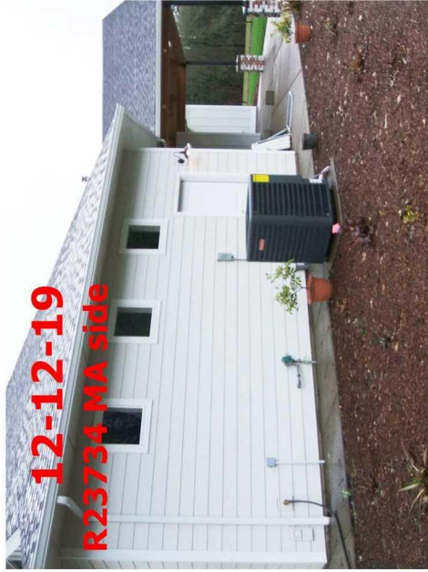
12-12-19 R23734 MA side