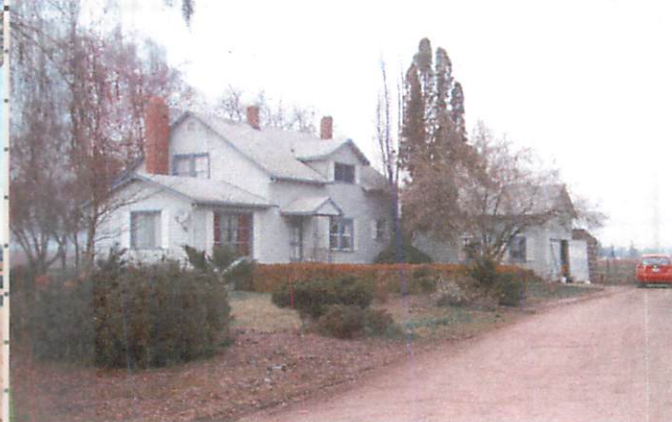
1-28-08 MA 1264