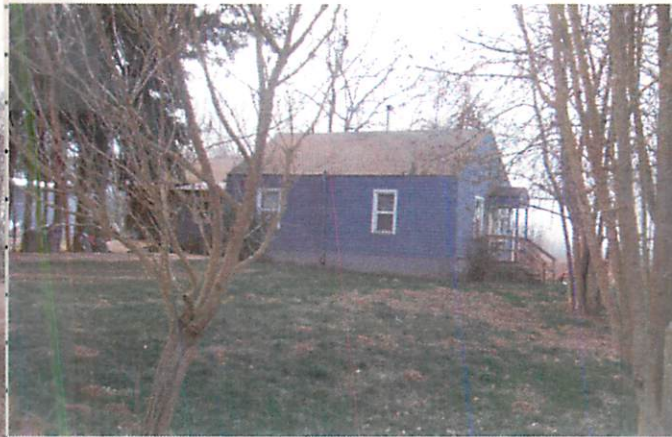
1-28-08 MA 720