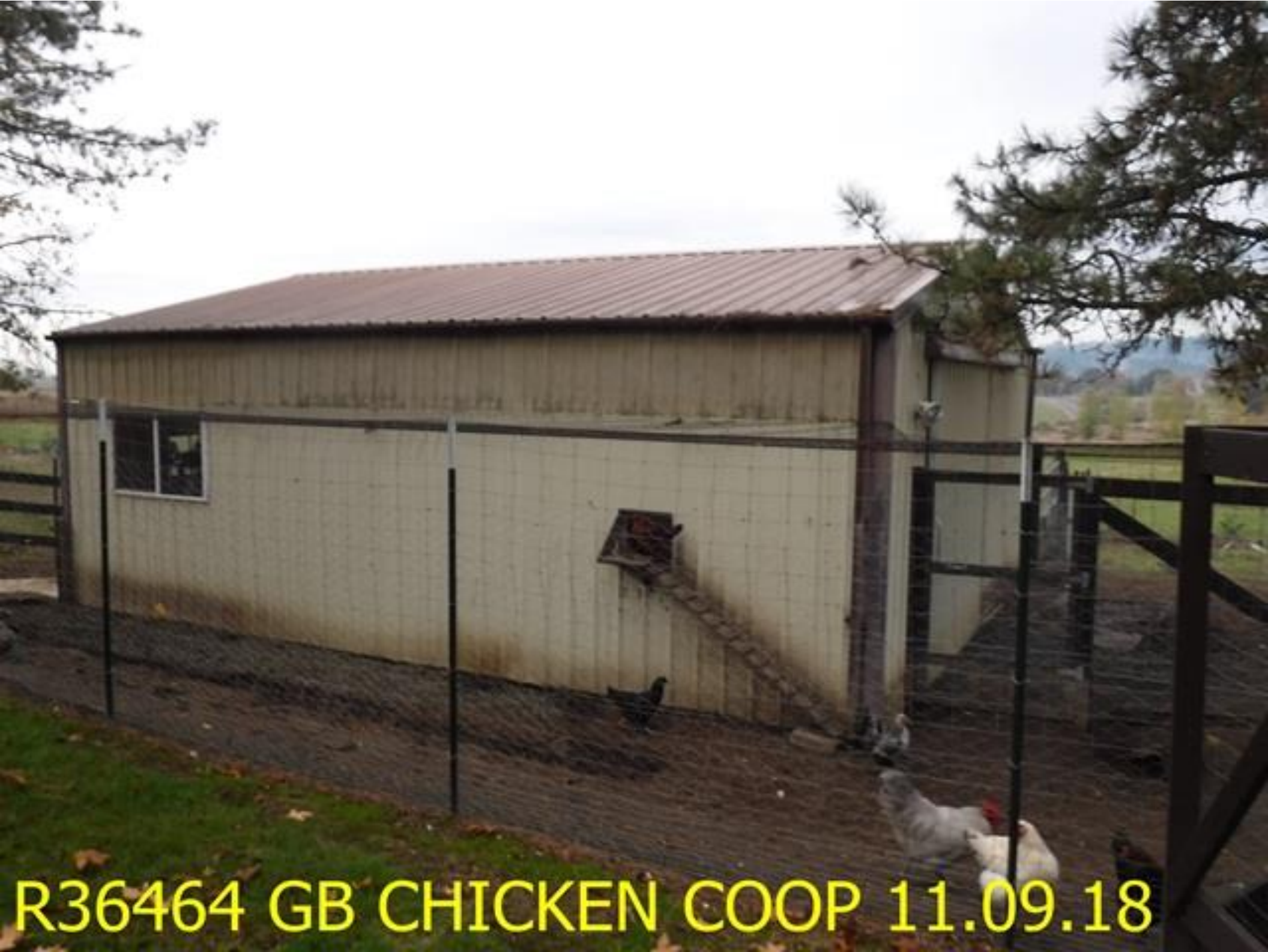
R36464 GB CHICKEN COOP 11.09.18