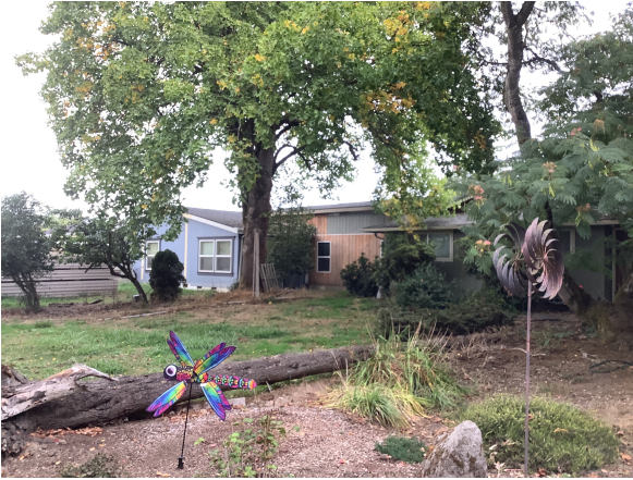
MANUF & ADDN 10/9/24