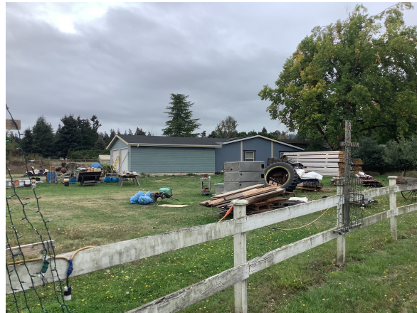
AGF & MANUF 10/9/24