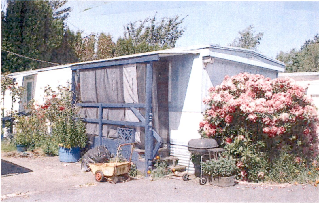
M125784 Stayton Trailer Ct. (26) 6-12-08