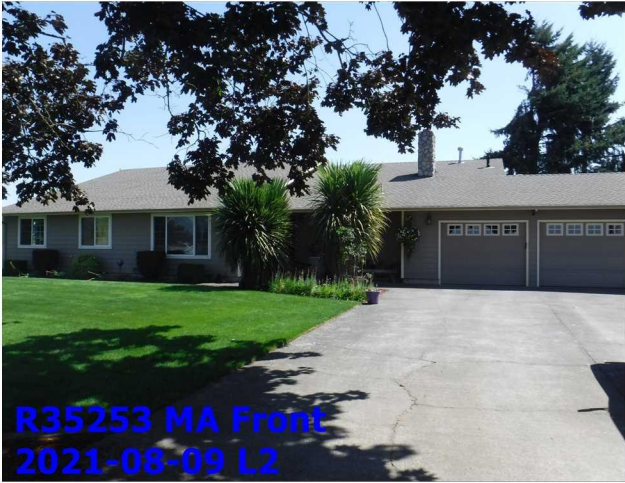
R35253 MA Front 2021-08-09 L2