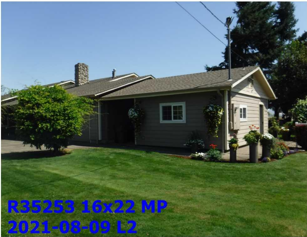
R35253 16x22 MP 2021-08-09 L2