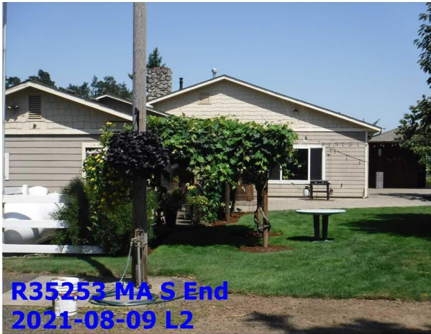
R35253 MA S End 2021-08-09 L2