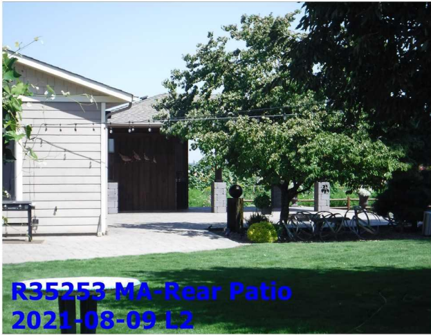
R35253 MA-Rear Patio 2021-08-09 L2