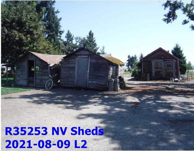
R35253 NV Sheds 2021-08-09 L2