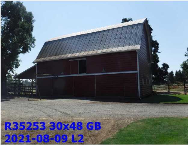
R35253 30x48 GB 2021-08-09 L2