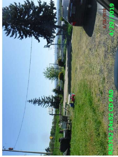
R35762 24x52 GB PAD 4/29/2019