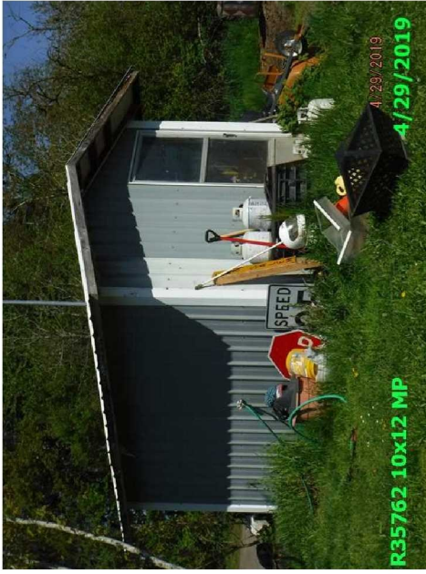
R35762 10x12 MP 4/29/2019