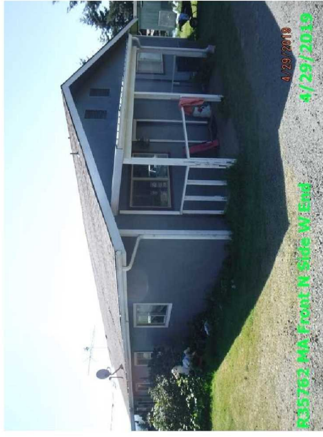
R35762 MA Front N Side W End 4/29/2019