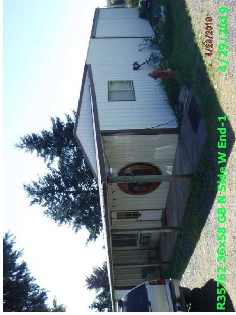
R35762 36x58 GB N Side W End-1 4/29/2019