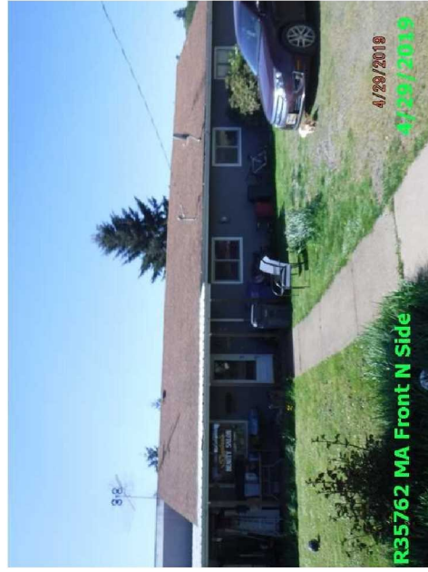
R35762 MA Front N Side 4/29/2019