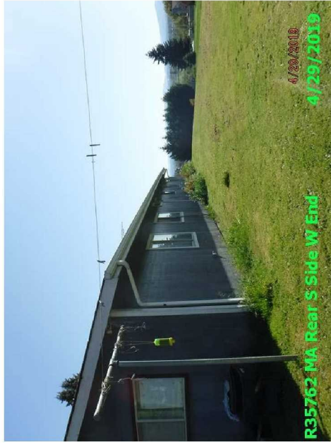
R35762 MA Rear S Side W End 4/29/2019