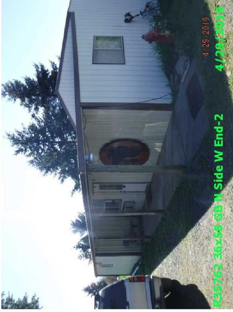
R35762 36x58 GB N Side W End-2 4/29/2019