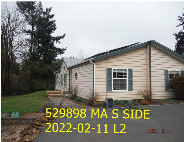
529898 MA S SIDE 2022-02-11 L2