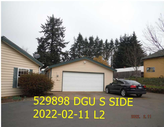
529898 DGU S SIDE 2022-02-11 L2