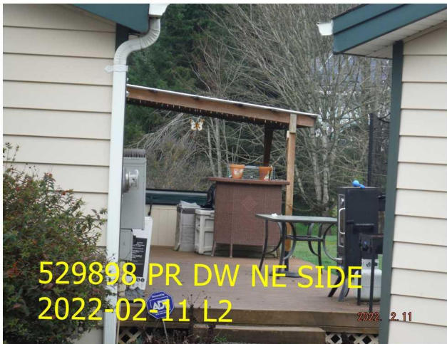
529898 PR DW NE SIDE 2022-02-11 L2