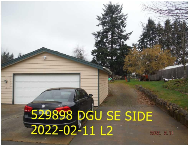
529898 DGU SE SIDE 2022-02-11 L2