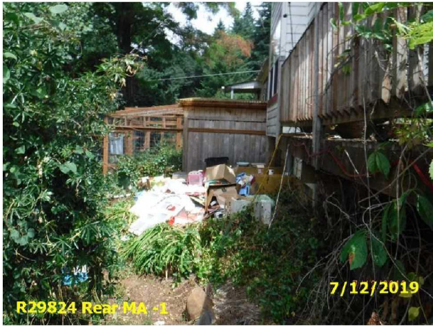
R29824 Rear MA -1