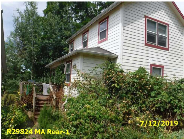
R29824 MA Rear-1