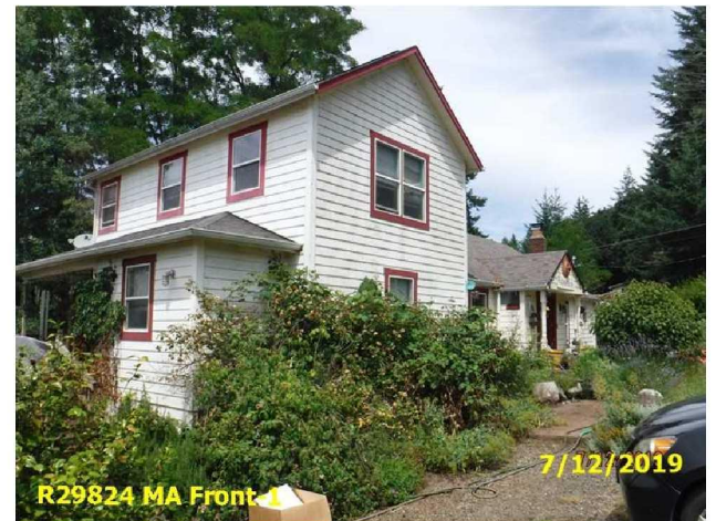
R29824 MA Front-1