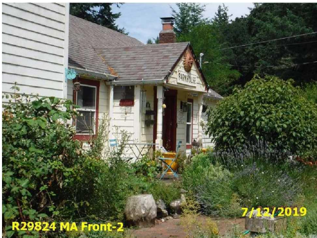
R29824 MA Front-2