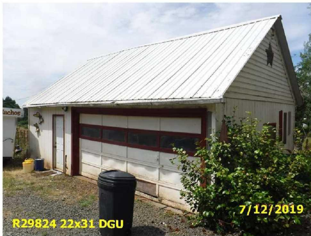
R29824 22x31 DGU