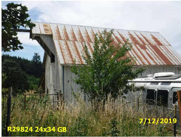
R29824 24x34 GB