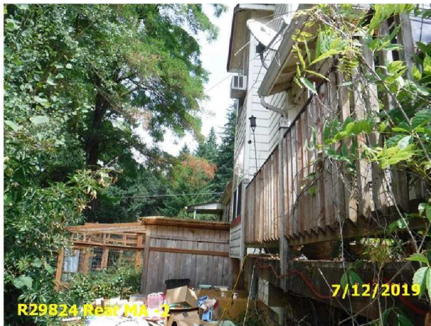
R29824 Rear MA -2