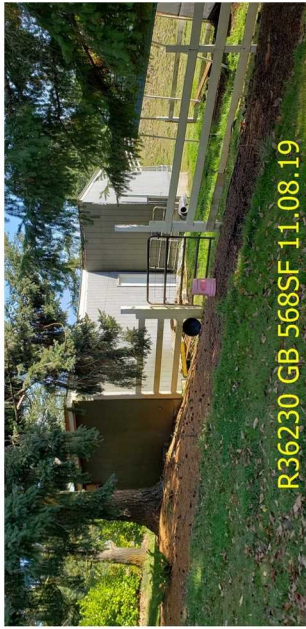
R36230 GB 568SF 11.08.19