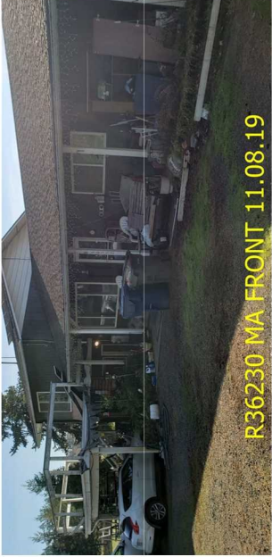
R36230 MA FRONT 11.08.19