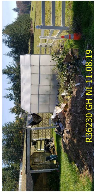
R36230 GH NI 11.08.19