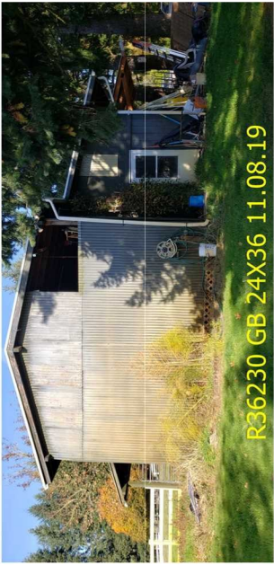
R36230 GB 24X36 11.08.19