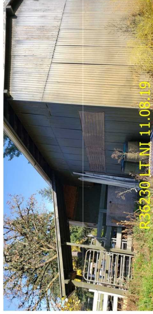
R36230 LT NI 11.08.19