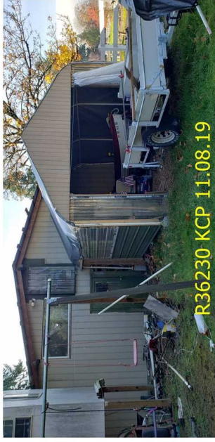
R36230 KCP 11.08.19