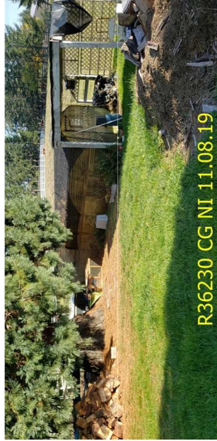
R36230 CG NI 11.08.19