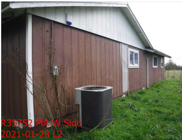
R35752 MA W Side 2021-01-28 L2