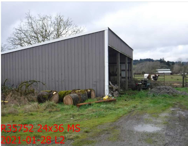
R35752 24x36 MS 2021-01-28 L2