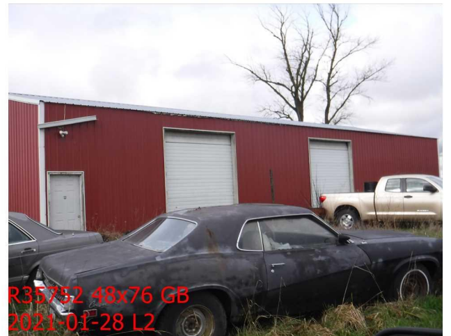
R35752 48x76 GB 2021-01-28 L2