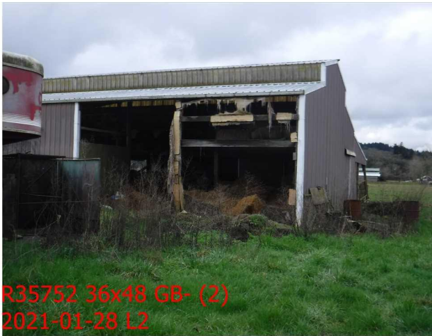
R35752 36x48 GB- (2) 2021-01-28 L2