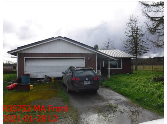
R35752 MA Front 2021-01-28 L2