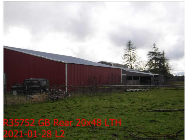
R35752 GB Rear 20x48 LTH 2021-01-28 L2