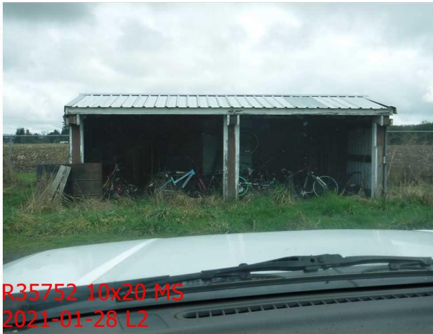
R35752 10x20 MS 2021-01-28 L2