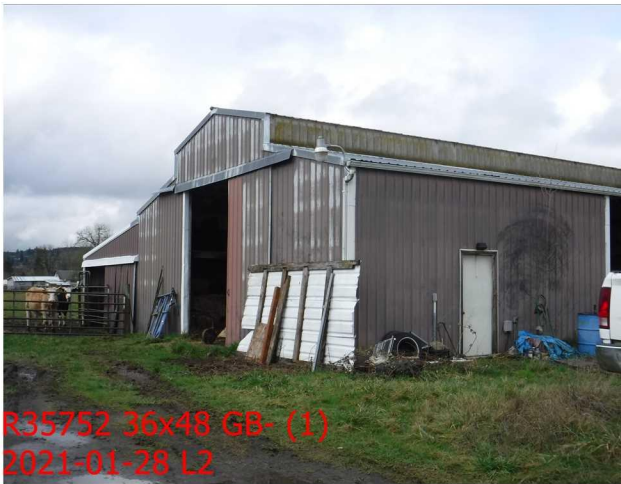
R35752 36x48 GB- (1) 2021-01-28 L2