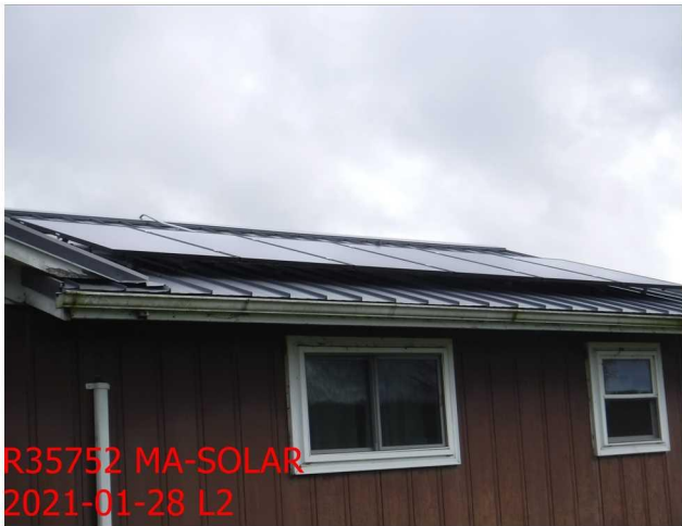
R35752 MA-SOLAR 2021-01-28 L2