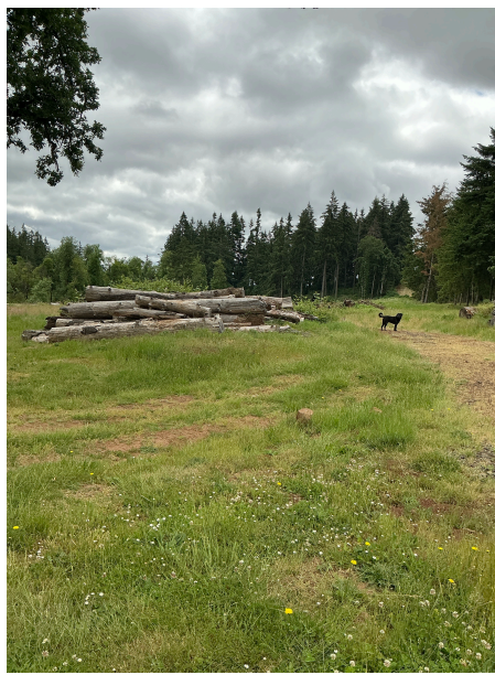
Right side no fencing or animals