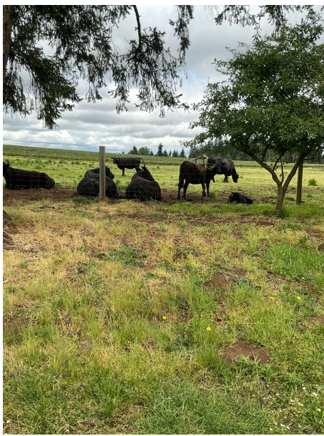
Left side of Driveway