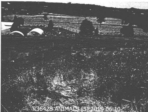
R36428 ANIMALS (5) 2019 06 10