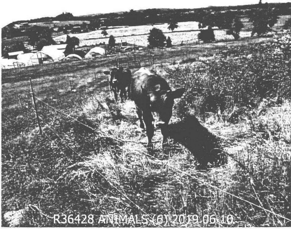
R36428 ANIMALS (6) 2019 06 10