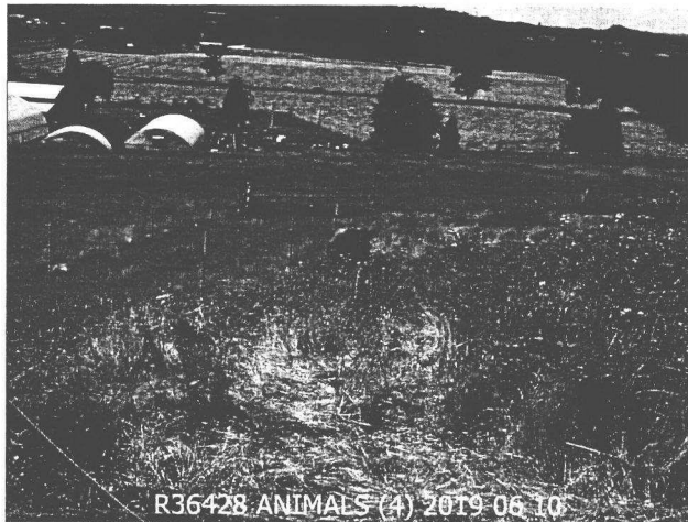
R36428 ANIMALS (4) 2019 06 10