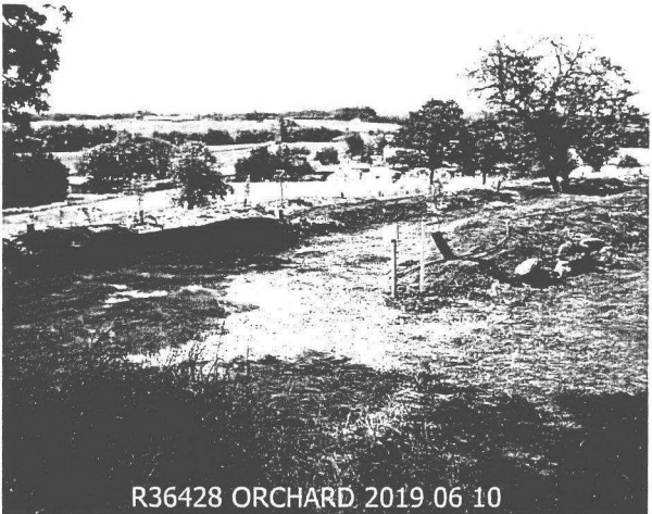
R36428 ORCHARD 2019 06 10