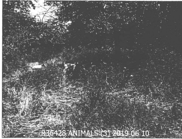
R36428 ANIMALS (3) 2019 06 10