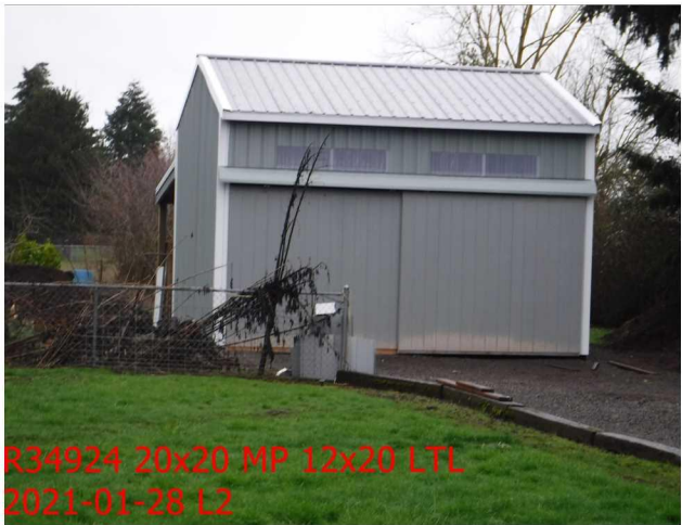
R34924 20x20 MP 12x20 LTL 2021-01-28 L2