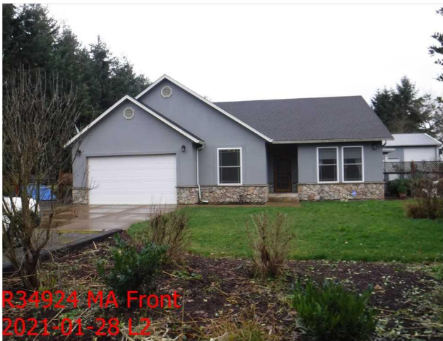
R34924 MA Front 2021-01-28 L2