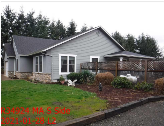
R34924 MA S Side 2021-01-28 L2