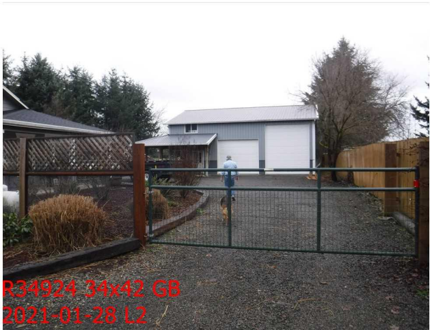
R34924 34x42 GB 2021-01-28 L2