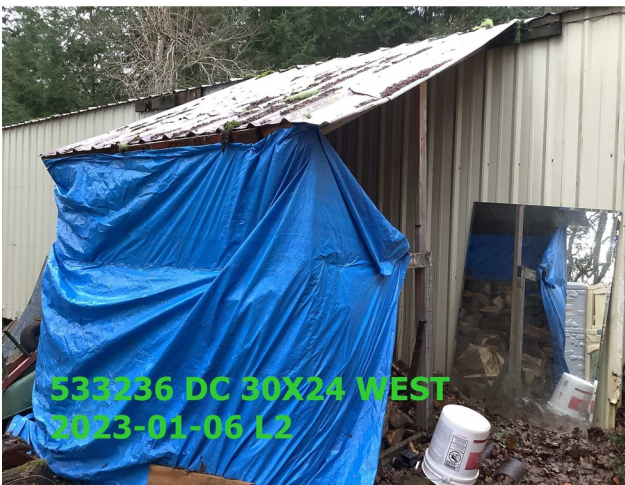
533236 DC 30X24 WEST 2023-01-06 L2