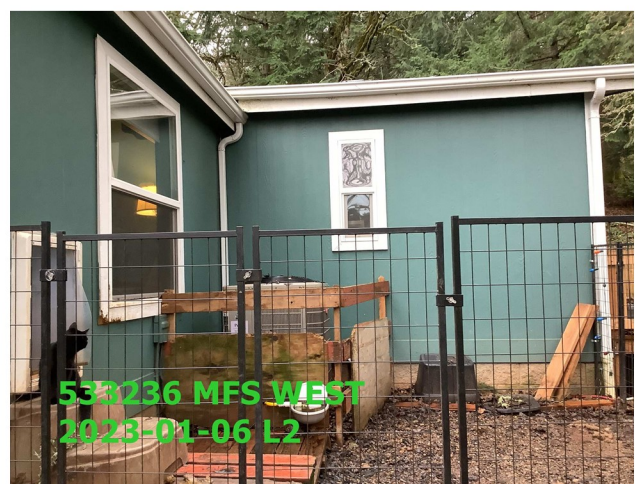
533236 MFS WEST 2023-01-06 L2