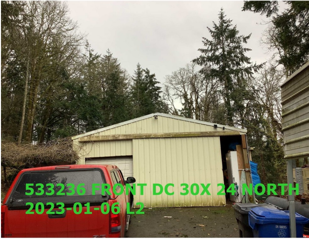
533236 FRONT DC 30X 24 NORTH 2023-01-06 L2