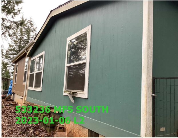
533236 MFS SOUTH 2023-01-06 L2