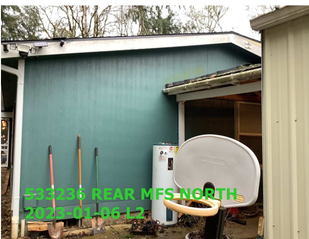
533236 REAR MFS NORTH 2023-01-06 L2