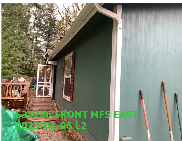
533236 FRONT MFS EAST 2023-01-06 L2