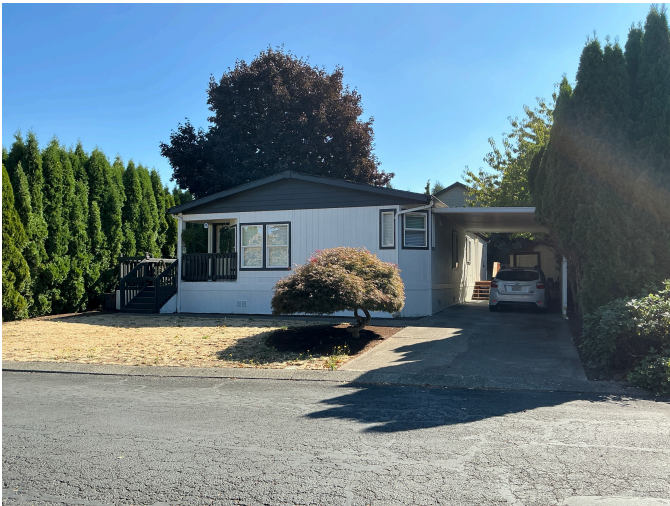
Photo new interior MLS Remo top to Bottom new floors, light, plumbing, CABS, CT'S

Improvements - Accessory Buildings No improvement data available for all other stat class types.