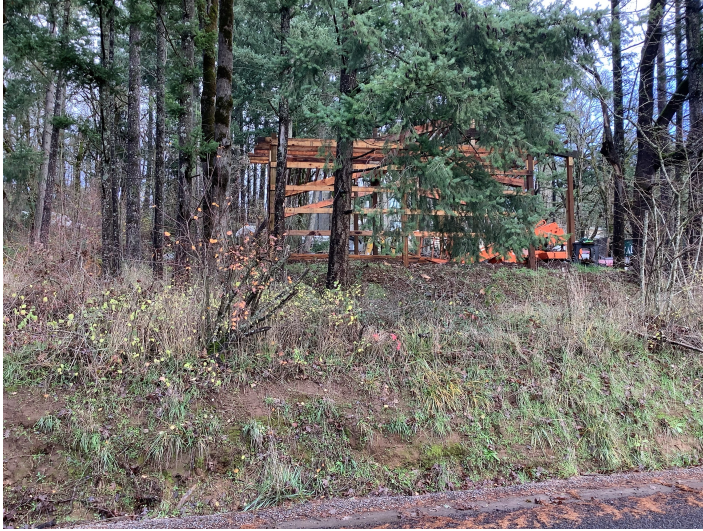
GB LTH 12.08.23 L3