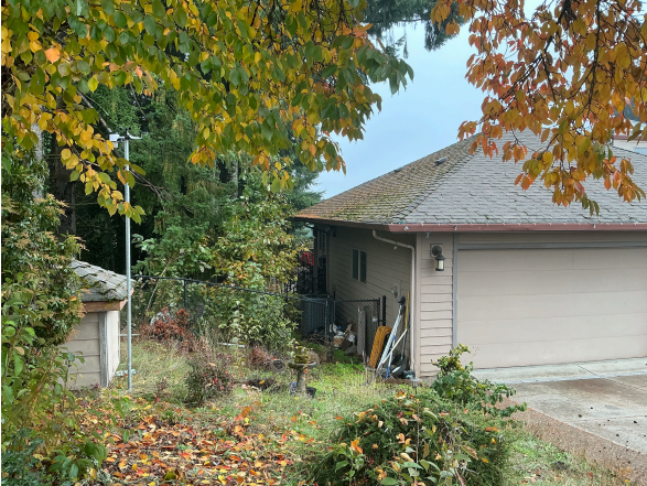
11.4.25 L2 LCB